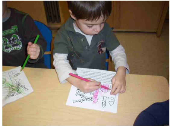
MOTOR SKILLS (PURIM BOOK) Coloring with pencil crayons, learning to hold the pencil correctly