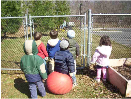
ECO-CONSCIOUSNESS AND RESPONSIBILITY: Keeping our yard tidy - watching the grass being cut.