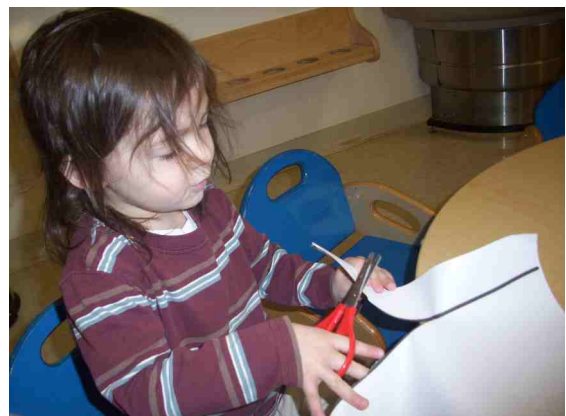
MOTOR SKILLS & MATH: Making a 2-piece puzzle