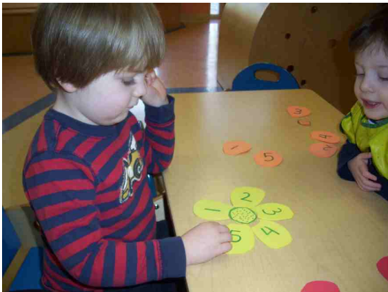
NUMBER RECOGNITION AND ONE-TO-ONE CORRESPONDENCE Counting with flower petals