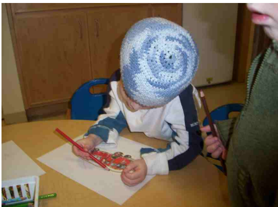
FINE MOTOR: Tracing around an object